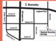
REGIONAL RECYCLING BURNABY 124 - 2190 Dale Avenue, Burnaby Tel: 604-291-3121

Q: What are the regulated electronic items included in the program?