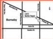
LEE'S BOTTLE & DEPOT 7303 Bellco Avenue, Burnaby Tel: 604-433-3432