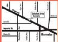
SALVATION ARMY - BURNABY 3443 Kingsway, Burnaby Tel: 604-433-6300

Here's where they can be safely recycled free of charge in Burnaby: