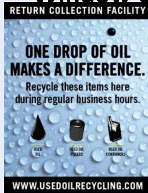
Table Top Display